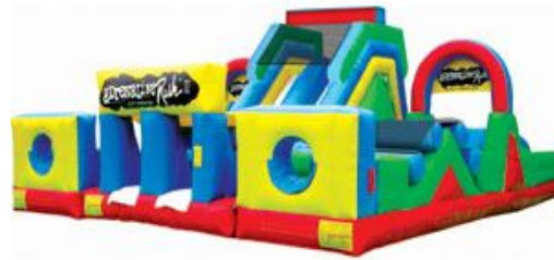
Catch a Wave.....