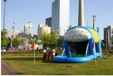
Golf Driving Inflatable.....